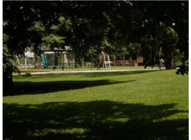
The beautiful park-like setting of the ECHO campus provides the idea location for community events.

ECHO has served the St. Louis community continuously since 1889, when it opened its doors as an orphanage. In the years since, the community's needs have many times changed and with each change, ECHO has transformed its programs and services to keep pace with the local needs. Today's needs are, now more than ever, economically driven, and although we cannot predict the future, it's reasonable to assume that these needs will continue and ECHO will be there to help meet for the years to come.