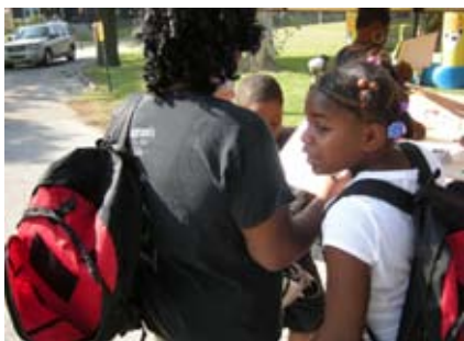
New backpacks filled with school supplies equipped area children the start of their school year.

In August, ECHO hosted its third annual back-to-school event and equipped 1500 area children with new backpacks filled with school supplies. The backpacks purchase was made possible by a very generous