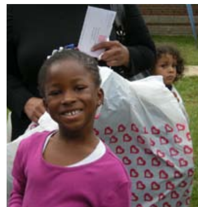
Each coat was purchased with size/gender information supplied by the parent, then bagged and tagged with their name and an ID number.

ECHO turned the coat distribution event into a fall festival with St. Louis area Disciples congregations participating in the event, staffing booths and offering refreshments, face painting, and new hats, gloves and socks. A local health clinic was also on hand providing free health and dental screenings for the children. A deejay added an extra festive touch with great music.