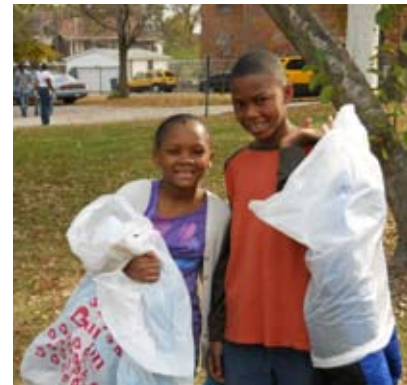
Two of the more than 660 children who received new winter coats in October. The Indian summer day was much too warm to wear a winter coat.

Gibson elementary 5th grade August 8, 2020 Dear Echo/benevolet services, Thank you for the book bag i really thank u for that it was very nice. And i thank you for the supplies my favorite color is red like the bookbag and i would like the person who got the bookbags come to the school. U were nice spending money on people that u don't know so just for doing that God will be with u this is my first year at this school. you made me think that the school is good already because you gave us the bookbag i just wanted to say thank you and always have positive energy around you. Sincerely, To: Eco benevolet Services