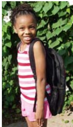
An elementary student models her new backpack.