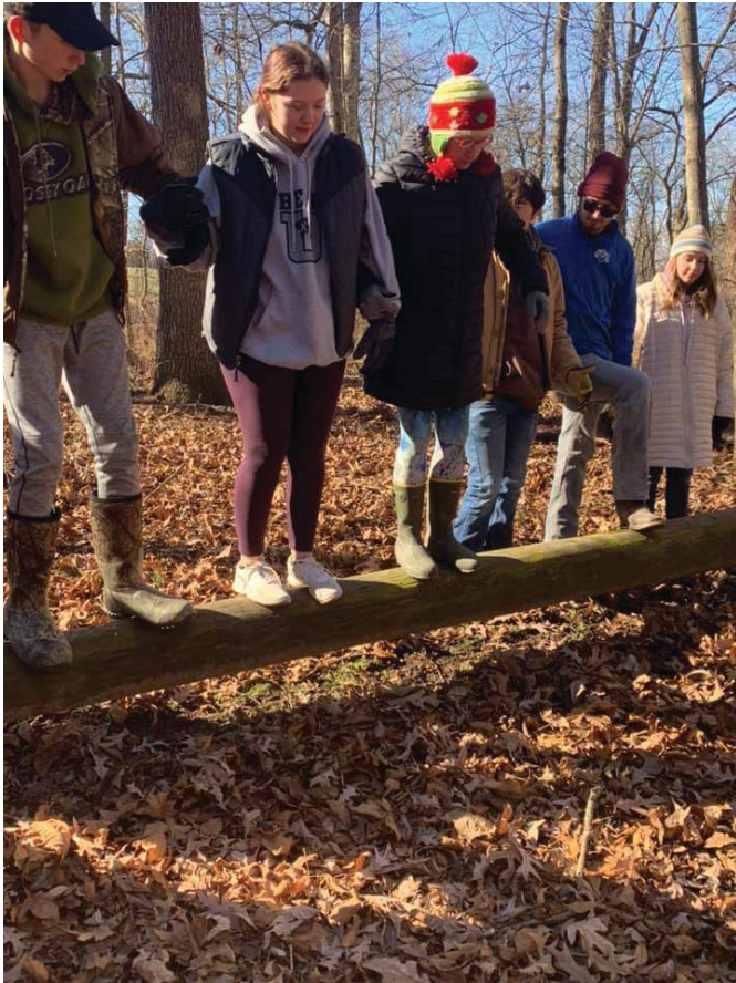
FCC Princeton's Venturing Crew experienced a ropes course as part of a leadership development retreat.