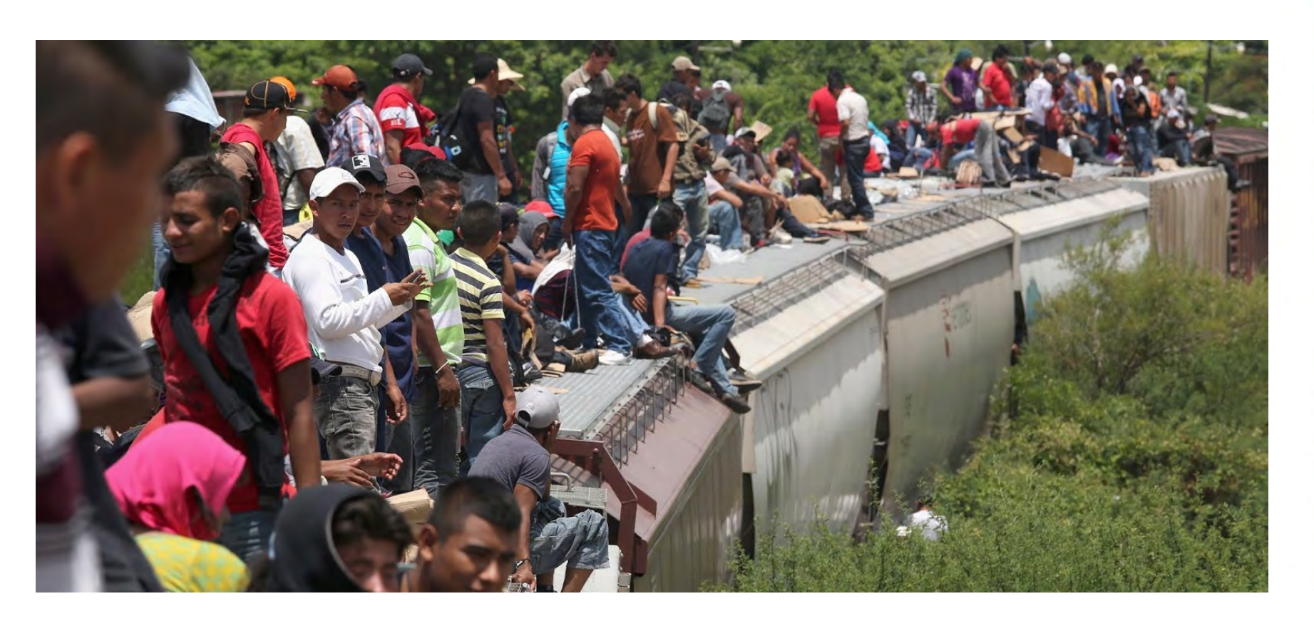
"They tried to bury us. They didn't know we were seeds." - Mexican Proverb