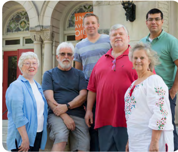
NBA XPLOR Spiritual Companions, 2018-19