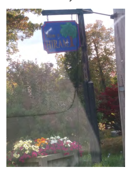
The Hiram sign to let us know we finally made it.